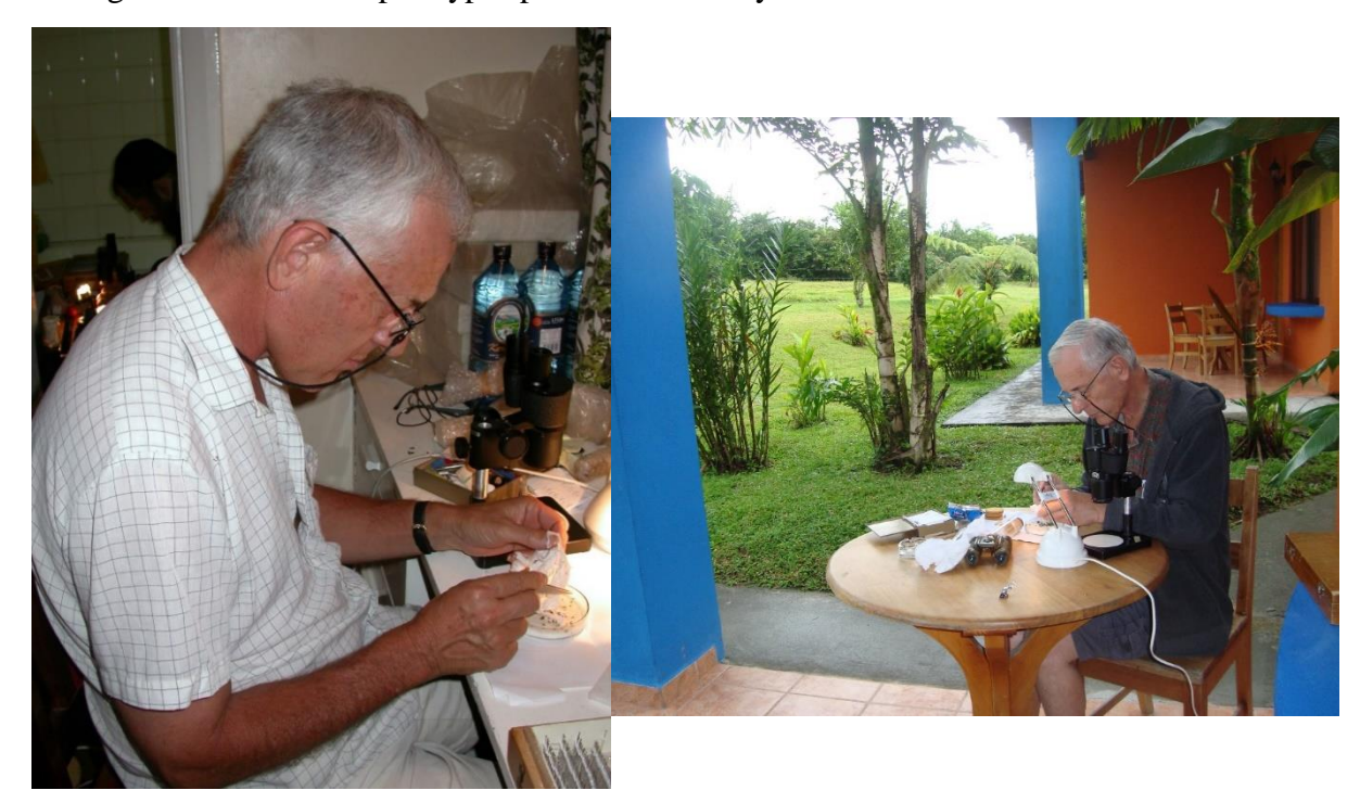
Pinning insects in Kenya, 2005 (left) and Costa Rica, 2010 (right).

on diverse and better understood characters, generously share material with other colleagues and distribute paratype specimens to many other museums.