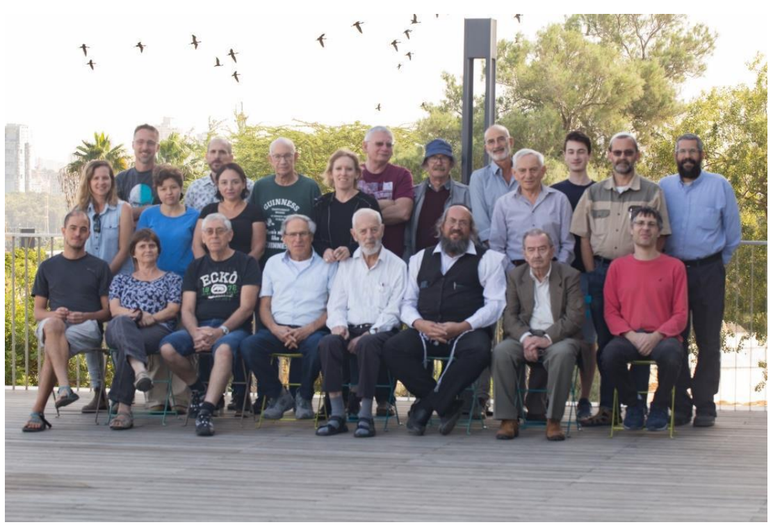
Staff of the entomology section in the Steinhardt Museum of Natural History, Tel Aviv University; 2019.